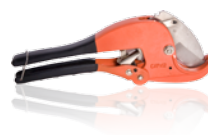
Q-therm (Normal Pipe Cutter)