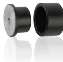
Q-therm (Welding Tools)