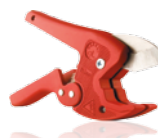
Q-therm (Automatic Pipe Cutter)