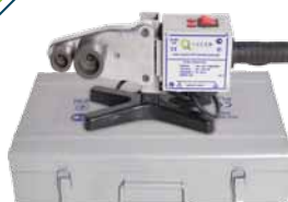
Q-therm (Welding Machine-Set)